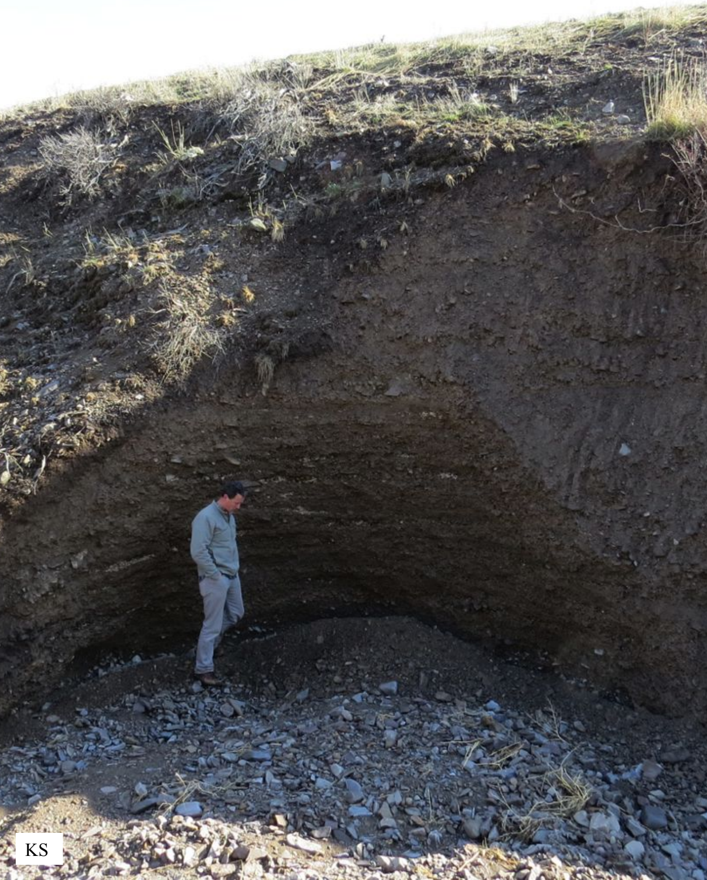
Philip inspects some of the erosion that occurred in the shrubby draws.