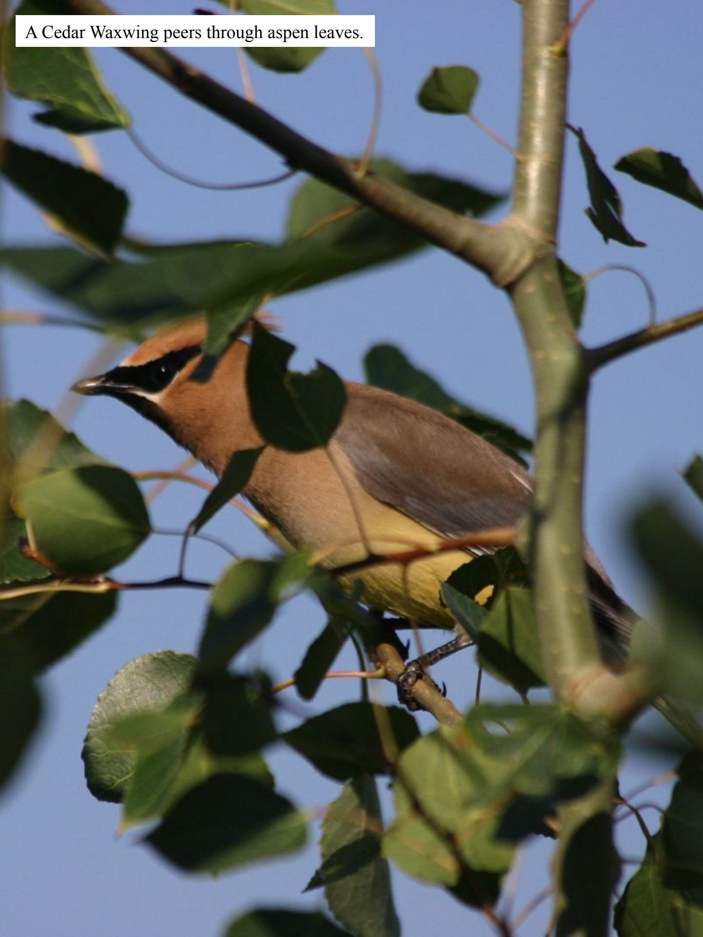
A Cedar Waxwing peers through aspen leaves.