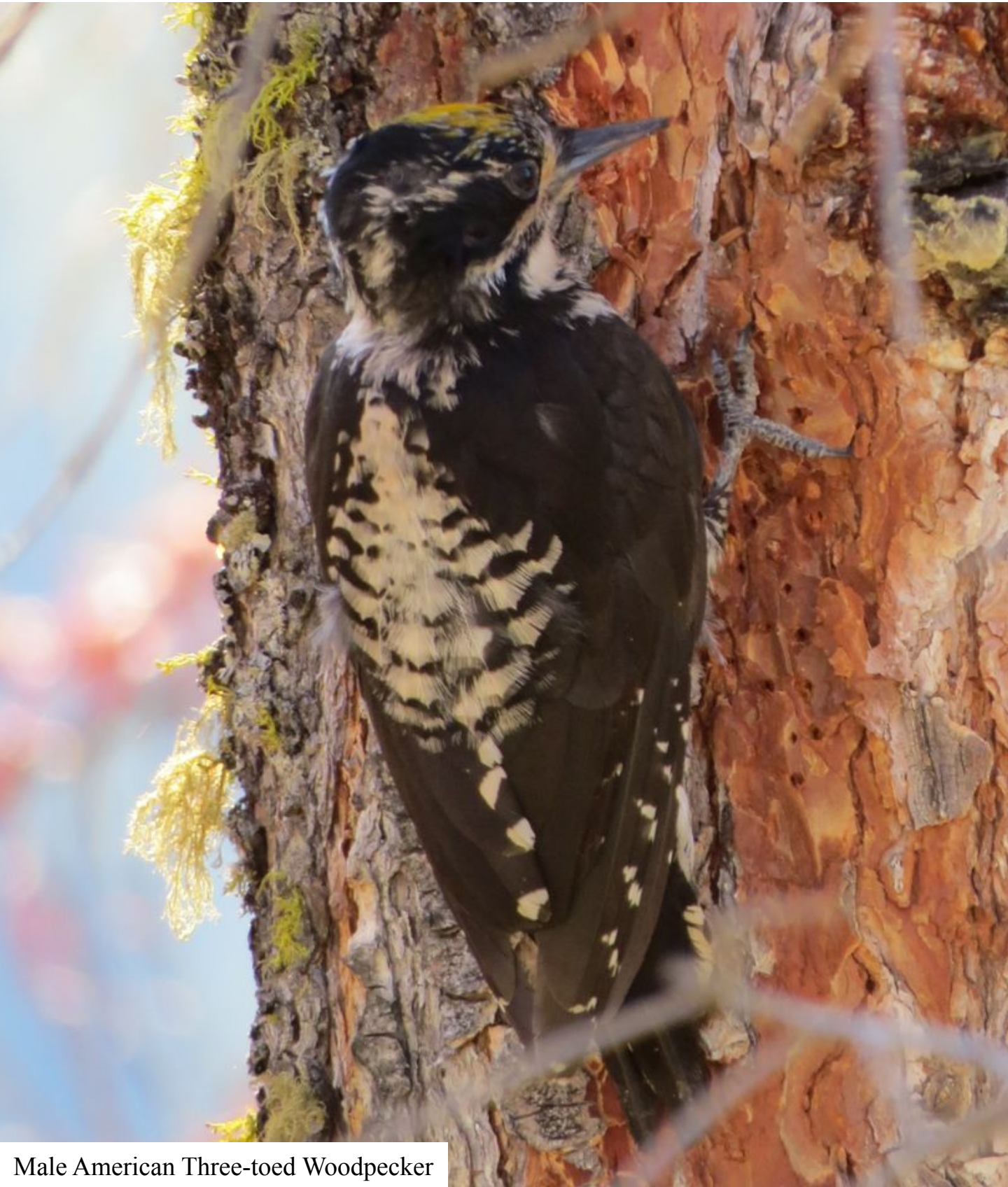
Male American Three-toed Woodpecker