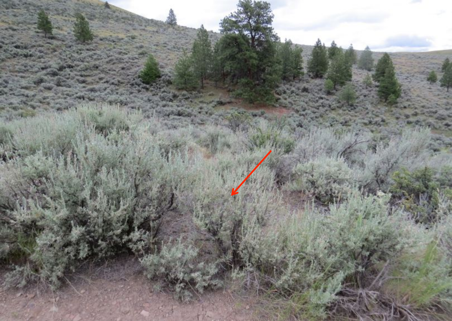
A Brewer's Sparrow fashioned her cup nest from grass and twigs.