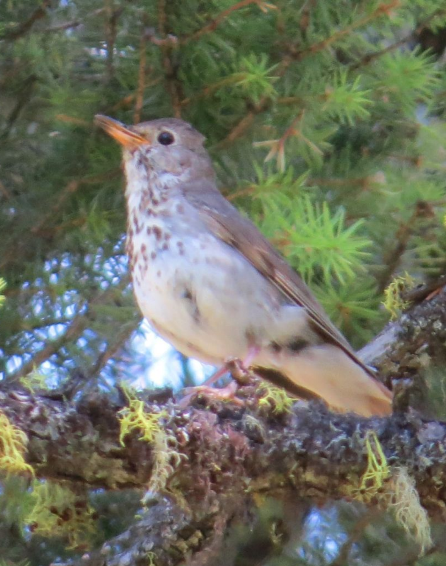
We usually hear Hermit Thrush more than we see them. This bird posed on an open and well-lit branch.