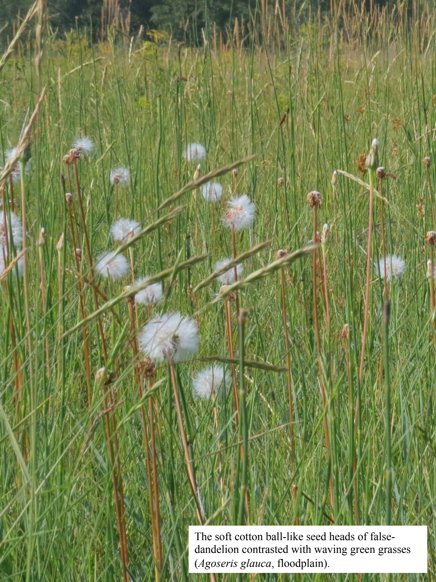
The soft cotton ball-like seed heads of false-dandelion contrasted with waving green grasses ( Agoseris glauca , floodplain).