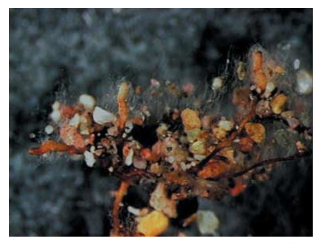
Fig. 1 Photograph of cottonwood ( Populus trichocarpa ) roots from a riparian area in Montana, USA, showing ectomycorrhizal root tips, fungal mycelium and adhering soil particles.