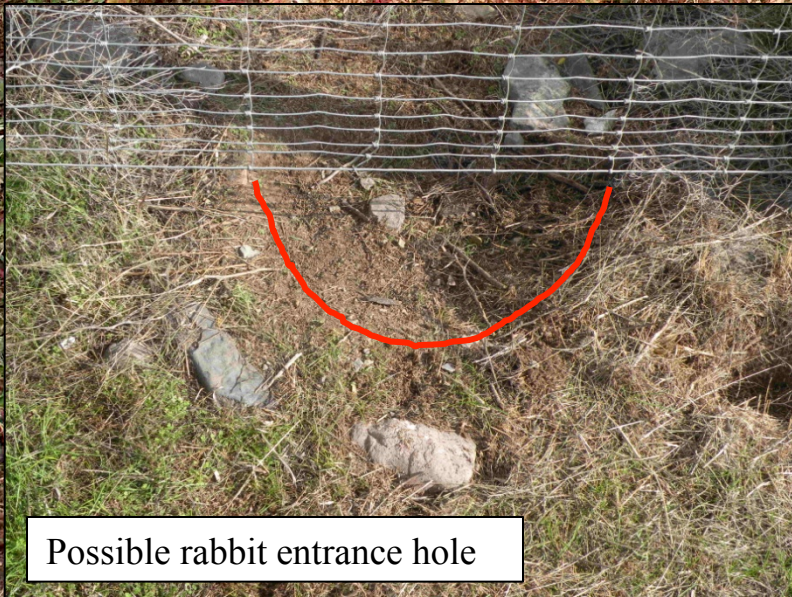
Possible rabbit entrance hole