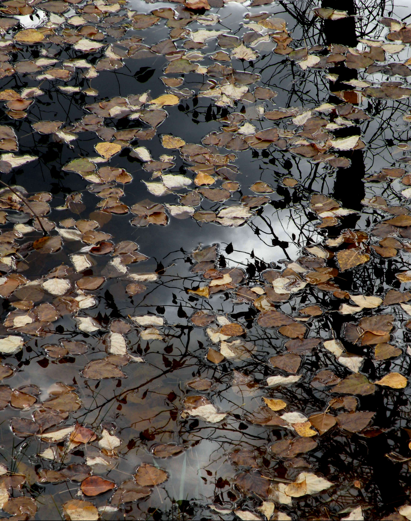
A hard frost on Wednesday sent many of the deciduous leaves floating to the ground.