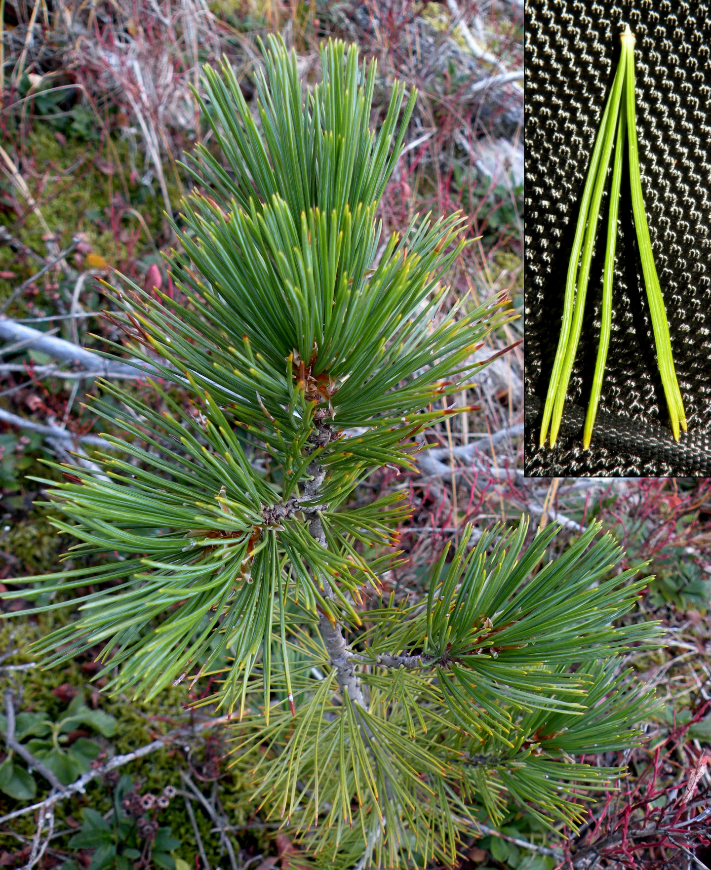
A 50 cm White Bark Pine grows on a NE aspect at 5000 ft in the Boondocks. A Clark's Nutcracker may have planted it several years ago. We will look for more of its kind.