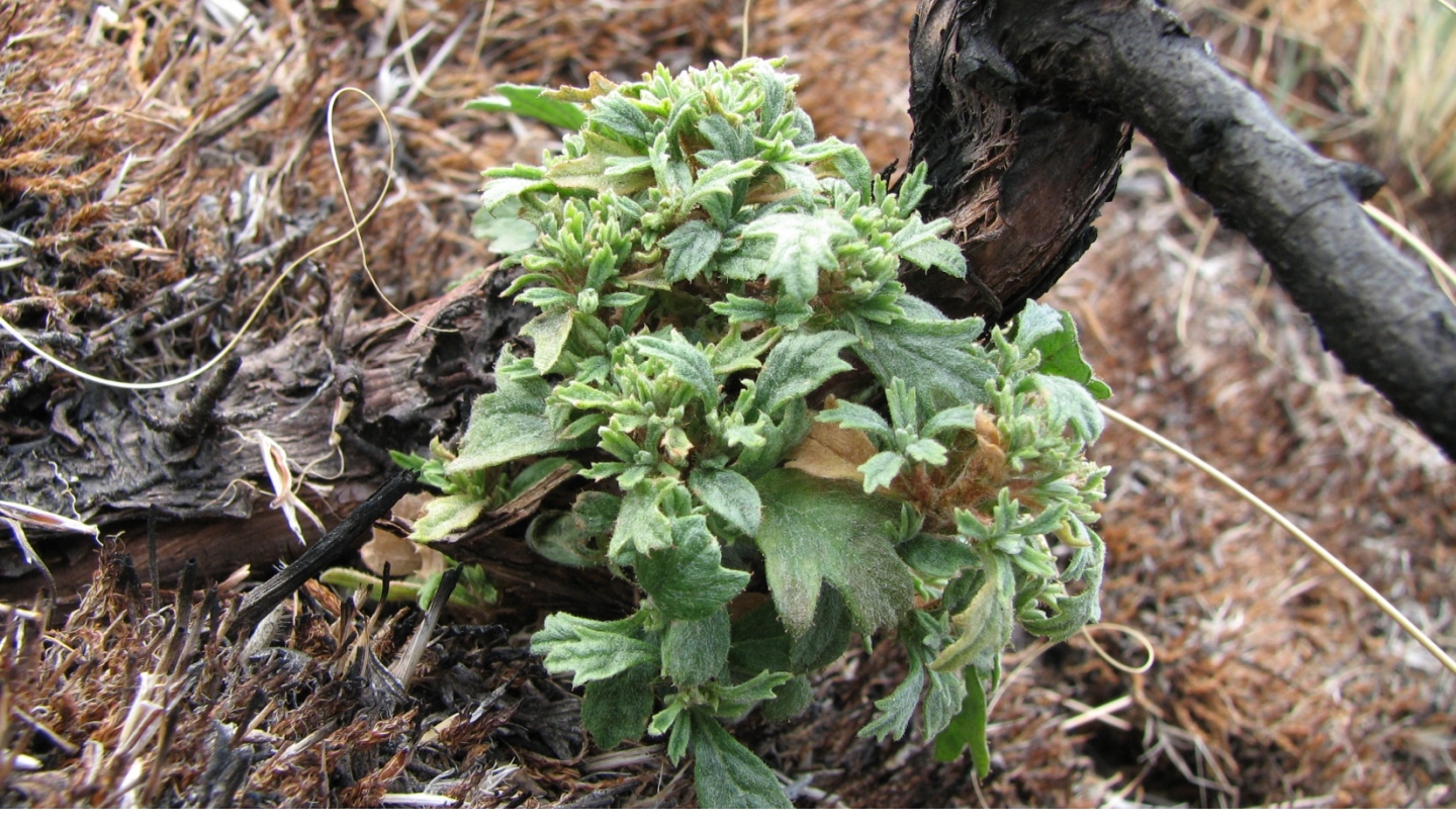
Resilient bitterbrush (above) sprouts new growth from superficially blackened branches. Once a vibrant yellow, dry rabbitbrush flowers (below) now resemble old cauliflower.