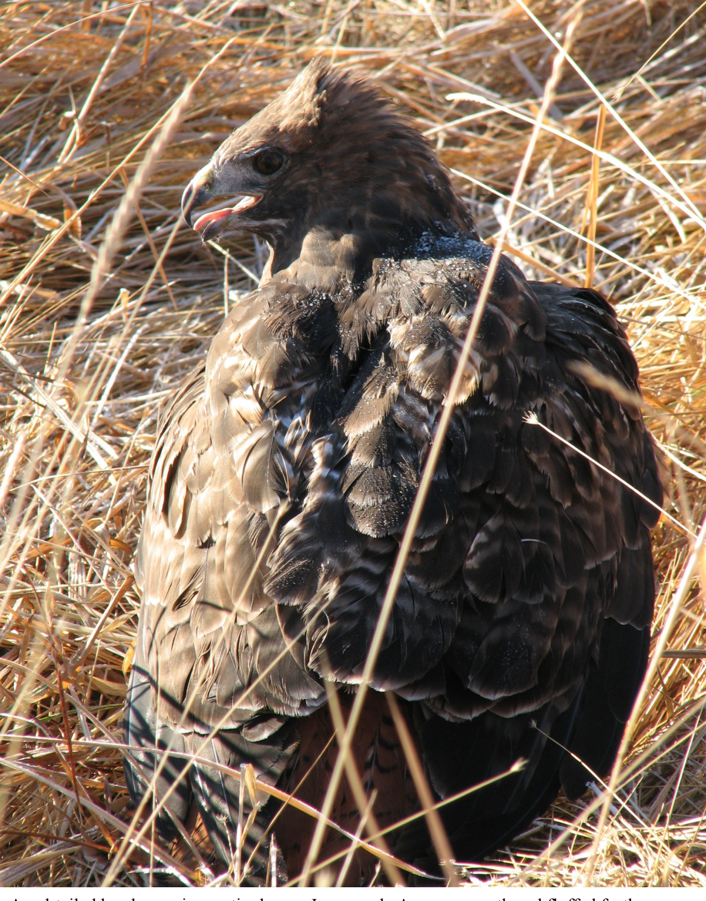
A red-tailed hawk remains motionless as I approach. An open mouth and fluffed feathers indicate a stressed bird. When I return several hours later, the bird is gone.