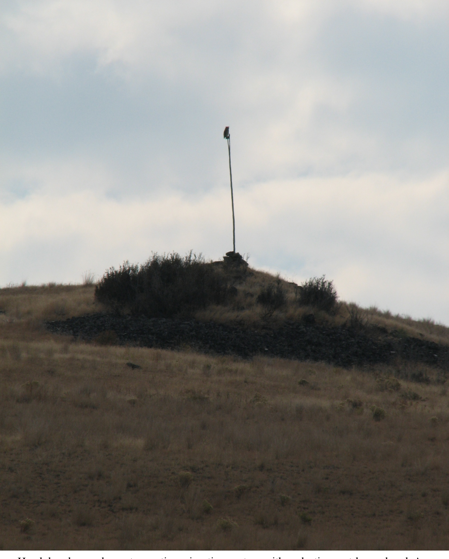
Hawk banders and counters entice migrating raptors with a plastic great-horned owl. A fearless predator, great-horned owls attack hawks, eagles, and other owls. Passing migrants spot the decoy and fly in for a closer view. Sometimes they swoop and hit it.