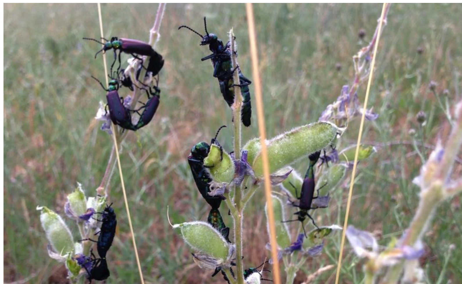
Blister beetles feed, mate, and fight on silky lupine ( Lupinus sericeus , North Ridge).