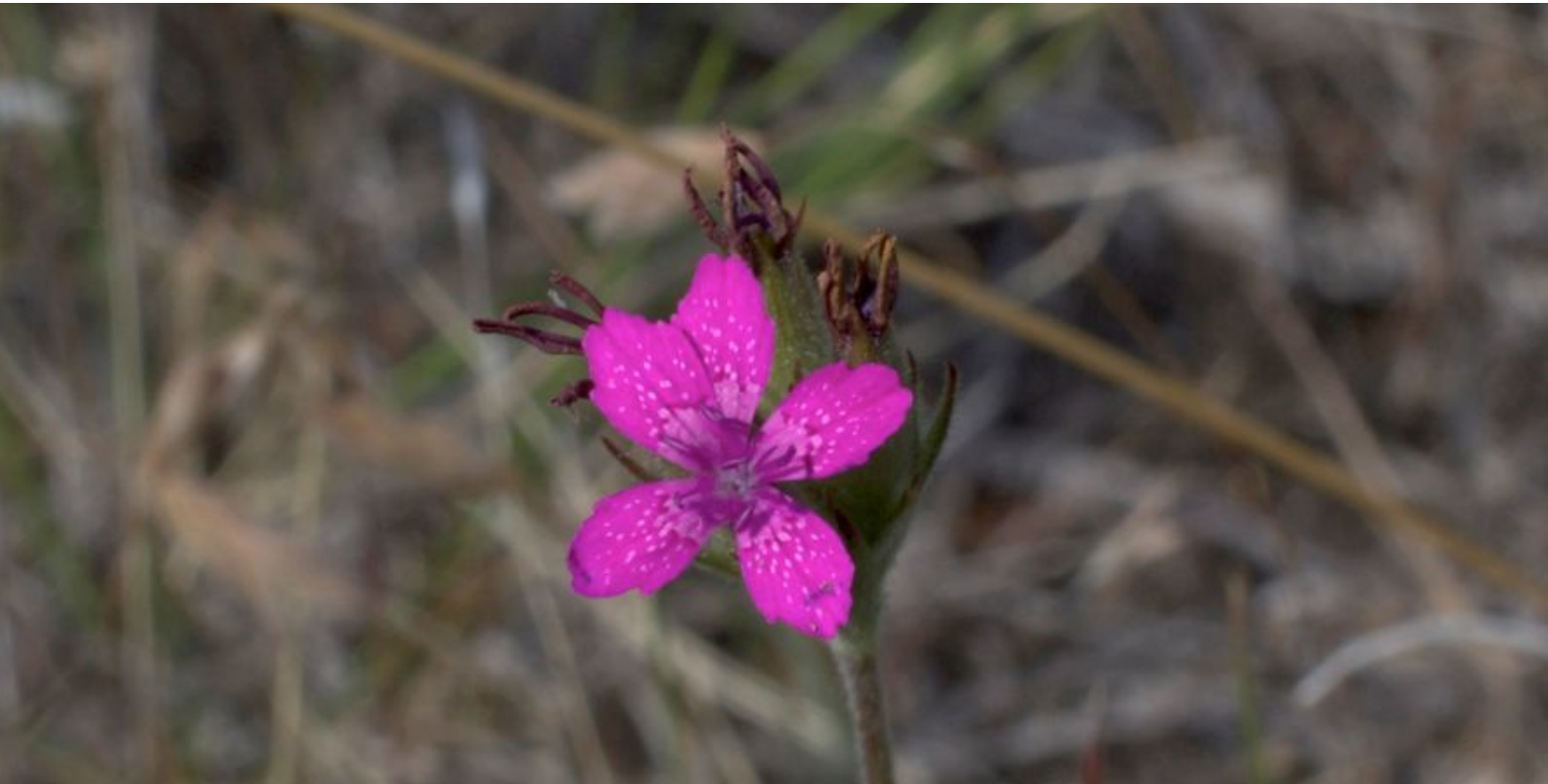
Deptford pink, a non-native member of the Caryophyllaceae family, appears in low density throughout western Montana ( Dianthus armeria , Native).