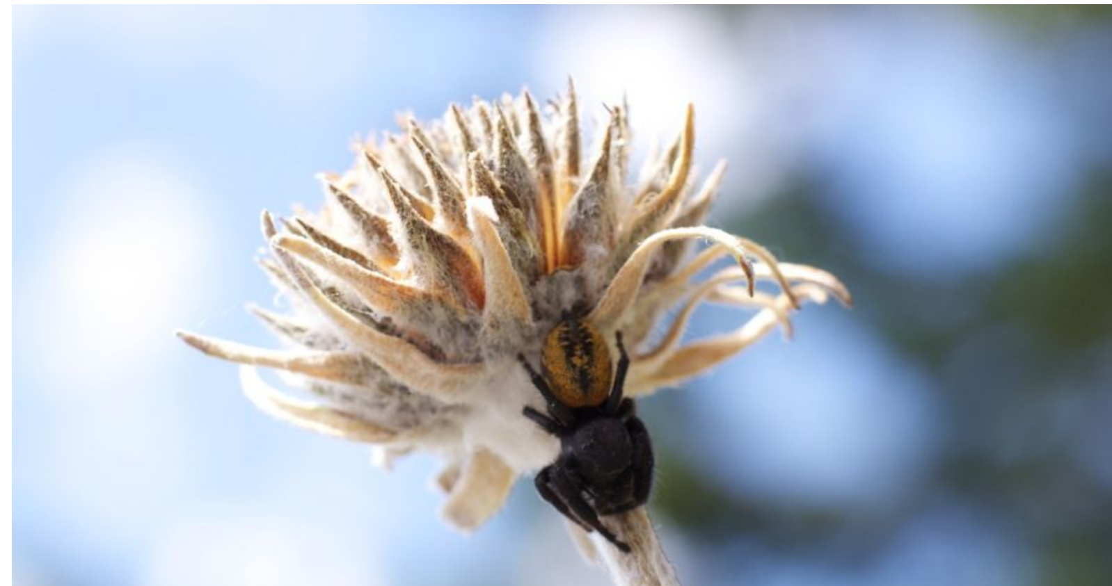
A spider's abdominal cardiac mark creates a focal point with a withered balsamorhiza flower ( Balsamorhiza sagittata , North Ridge).