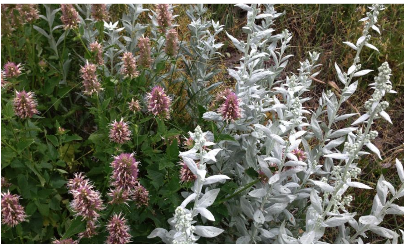
The striking contrast of pink horsemint with grey prairie sage catches my eye ( Agastache urticifolia , left, Artemisia ludoviciana , right, Baldy).