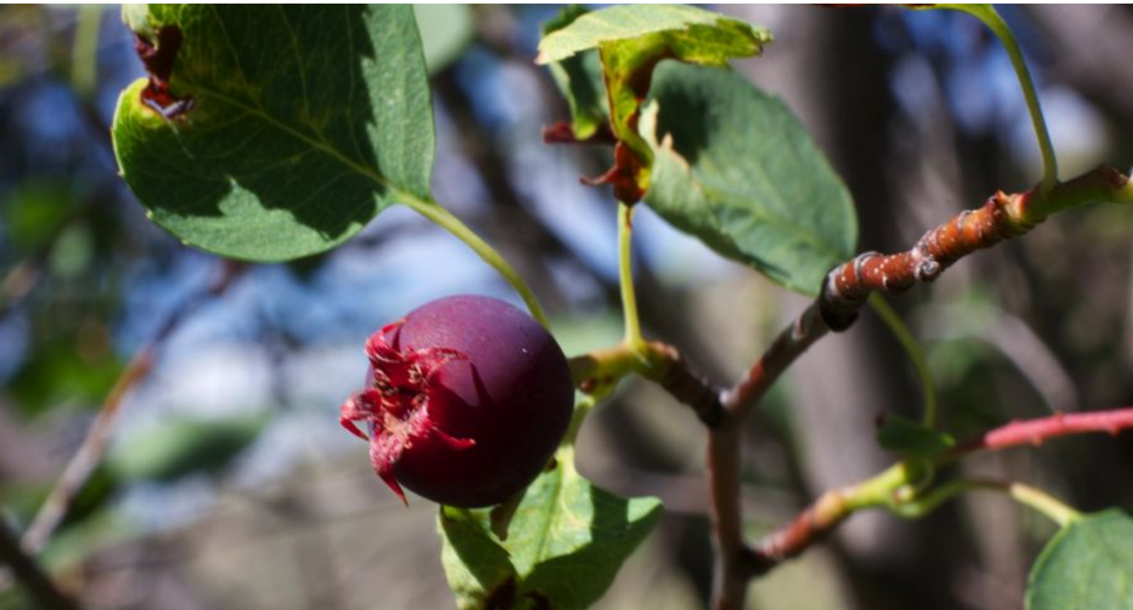
Luscious serviceberries ripen in woody draws. The flesh of the fruit tastes mildly sweet, but the seeds release a delicious vanilla flavor ( Amelanchier alnifolia , Whaley).