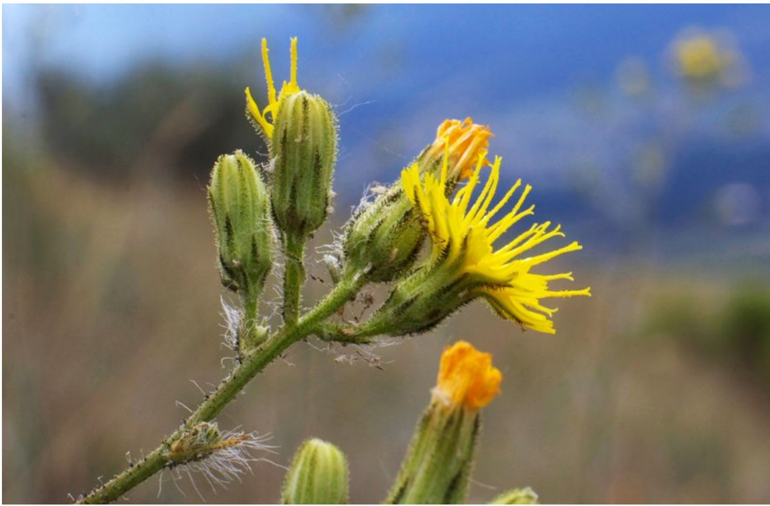
Noxious hawkweeds plague much of North America. This Scouler's hawkweed is native to Montana ( Hieracium scouleri , Boondocks).