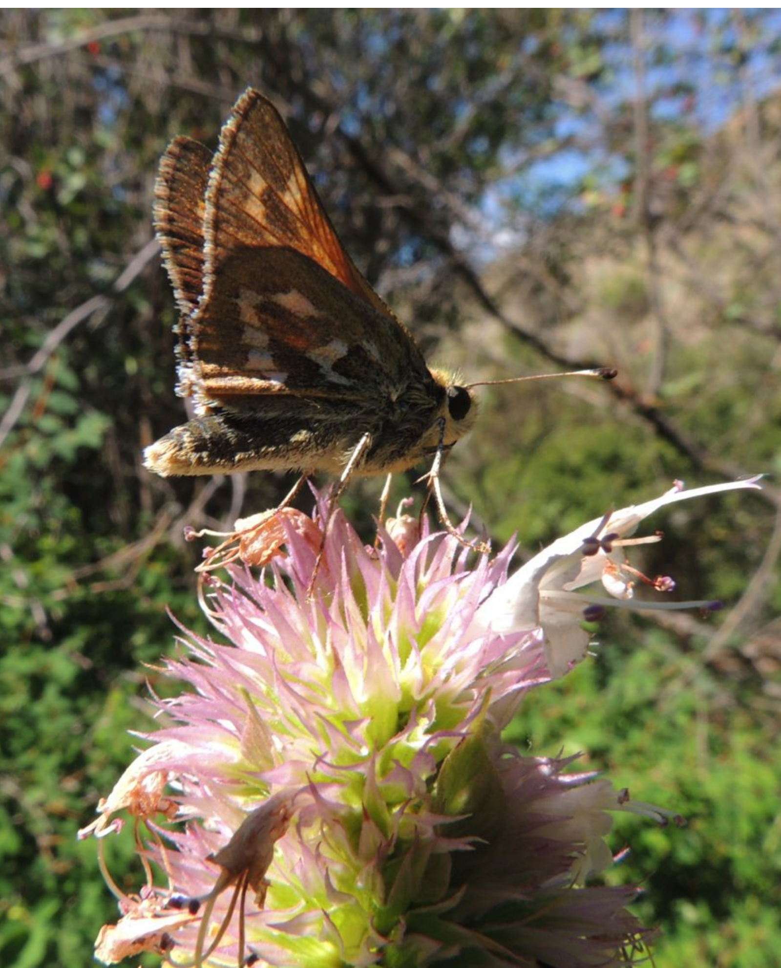
A juba skipper perches on a fading blossom of horse mint ( Hesperia juba on Agastache urticifolia , Whaley).