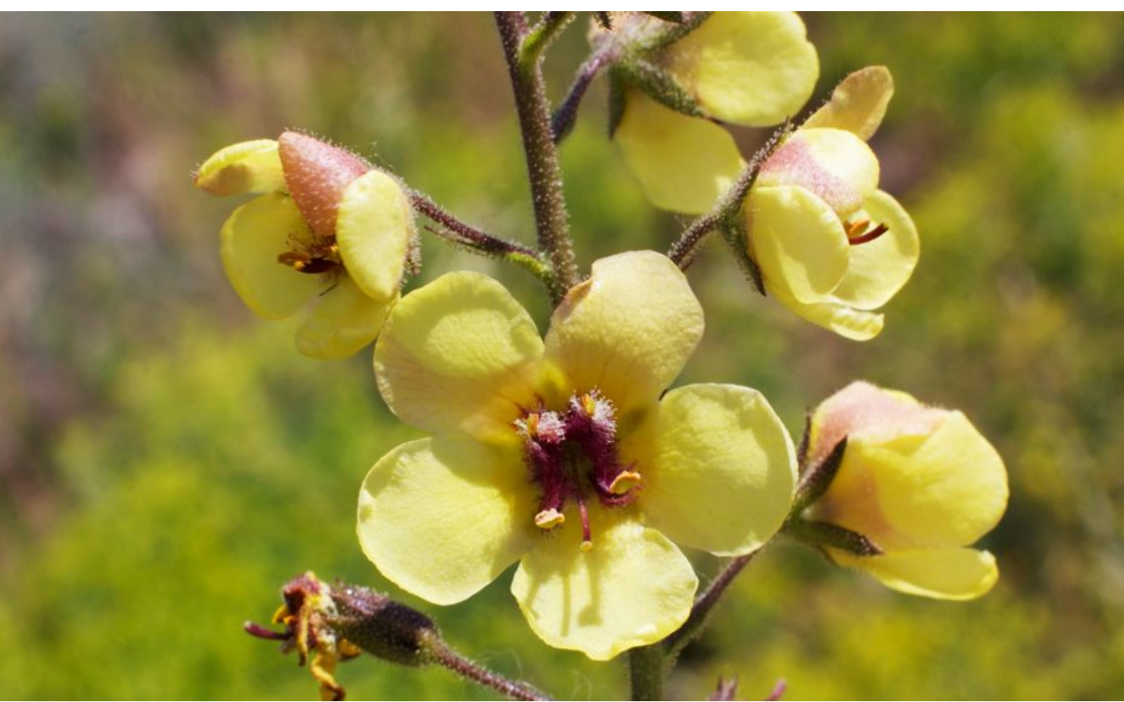
Moth mullein, a non-native species, blooms with pastel elegance ( Verbascum blattaria , Corral).