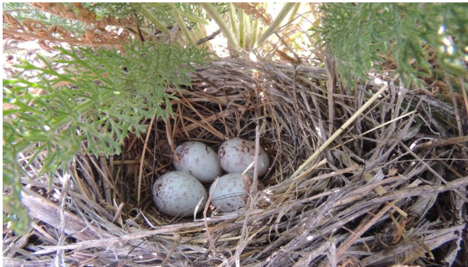
A vesper sparrow nest beneath a yarrow plant reveals tiny mottled eggs ( Achillea millefolium , North Center Pivot).