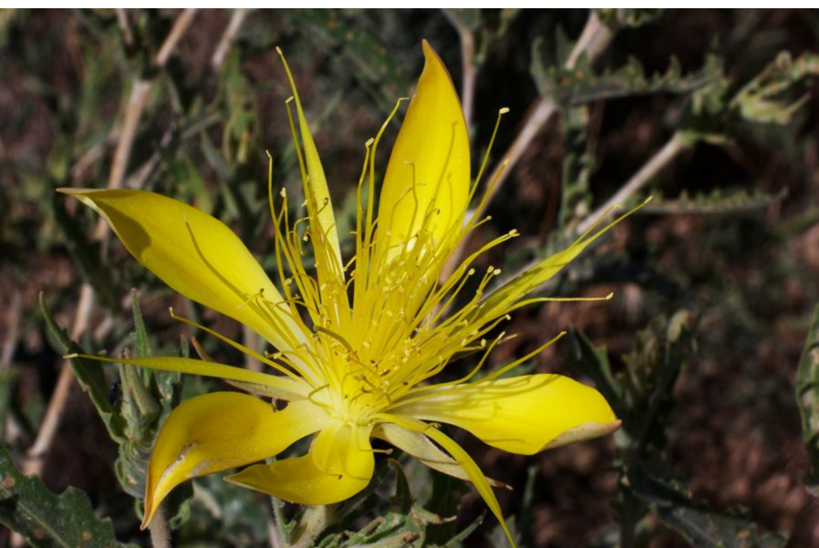
Blazing star blooms like a firecracker ( Mentzelia laevicaulis , Corral).