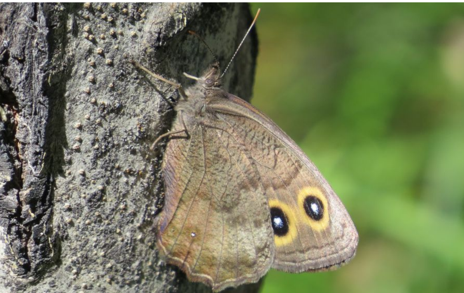
Common Wood Nymphs ( Cercyonis pegala ) have eyespots that may discourage predator attacks.