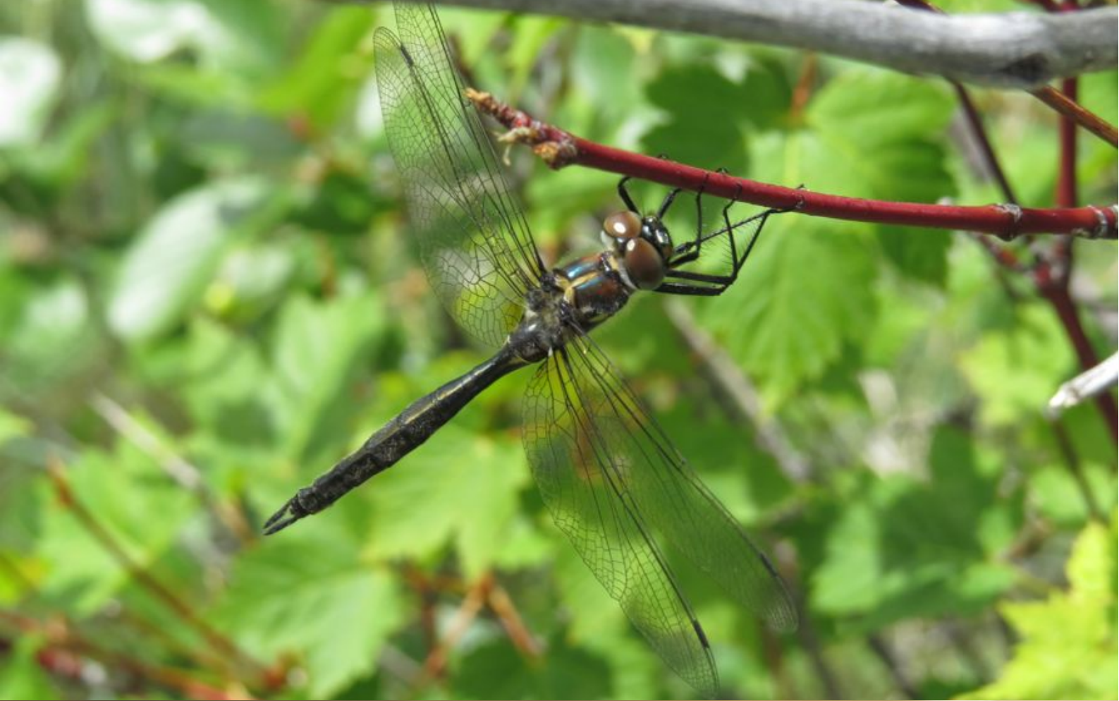
Brush-tipped Emeralds are a species of concern in Montana due to limited population numbers or habitat. This specimen patrols the ponds in Whaley Draw.