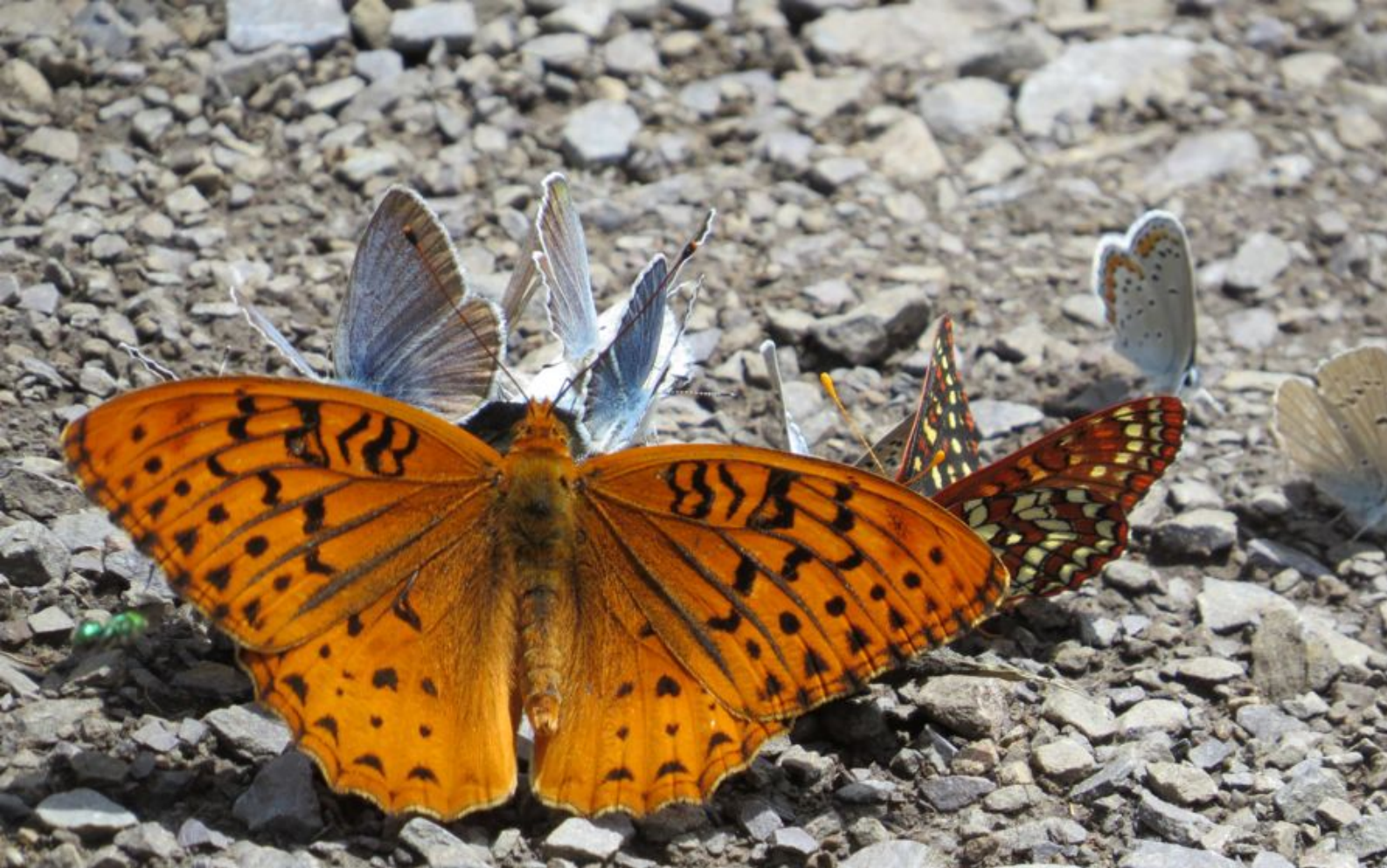
A Northwestern Fritillary ( Speyeria hesperis ) congregates with a checkerspot and several blues.