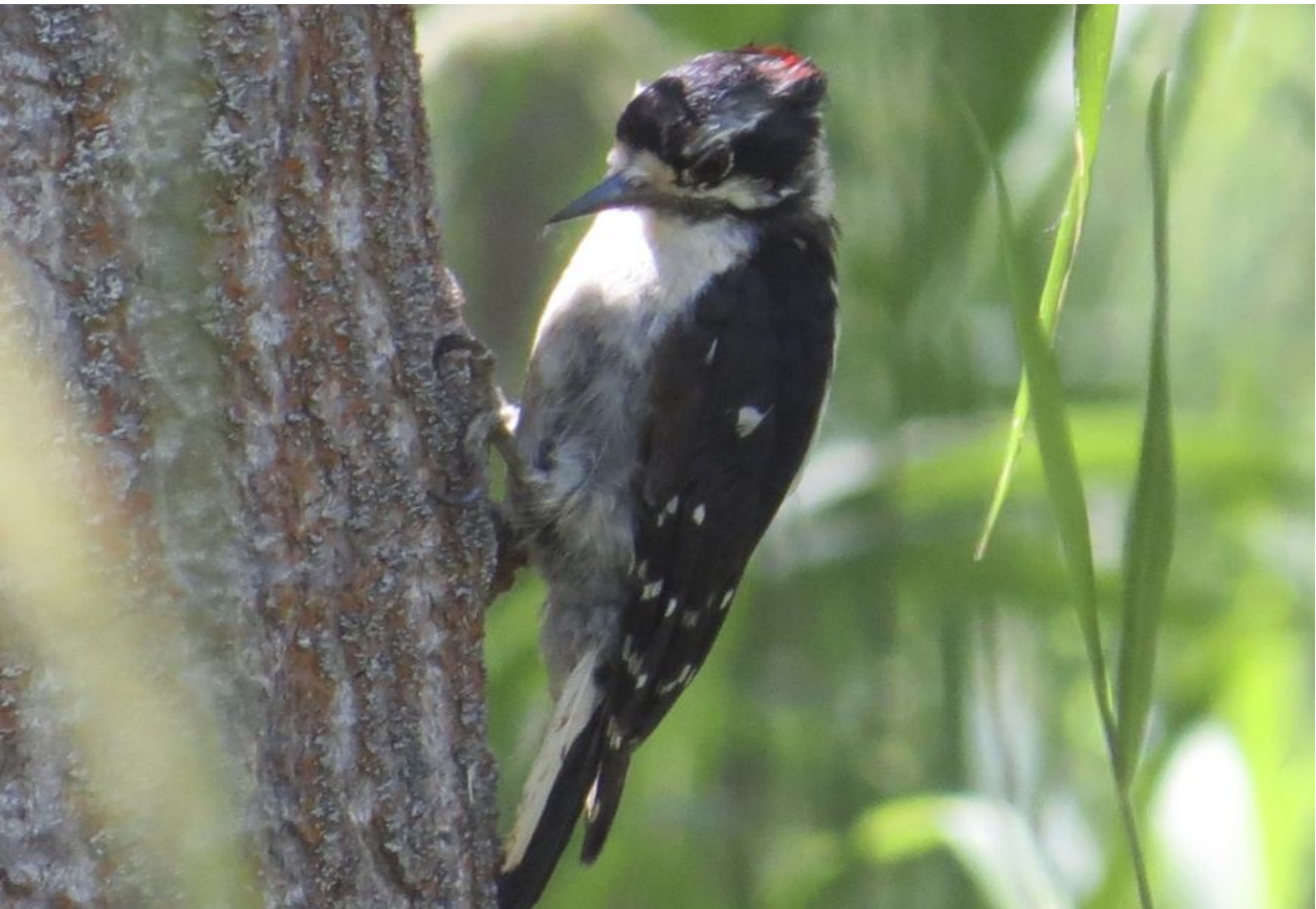
A downy woodpecker clings to a tree.