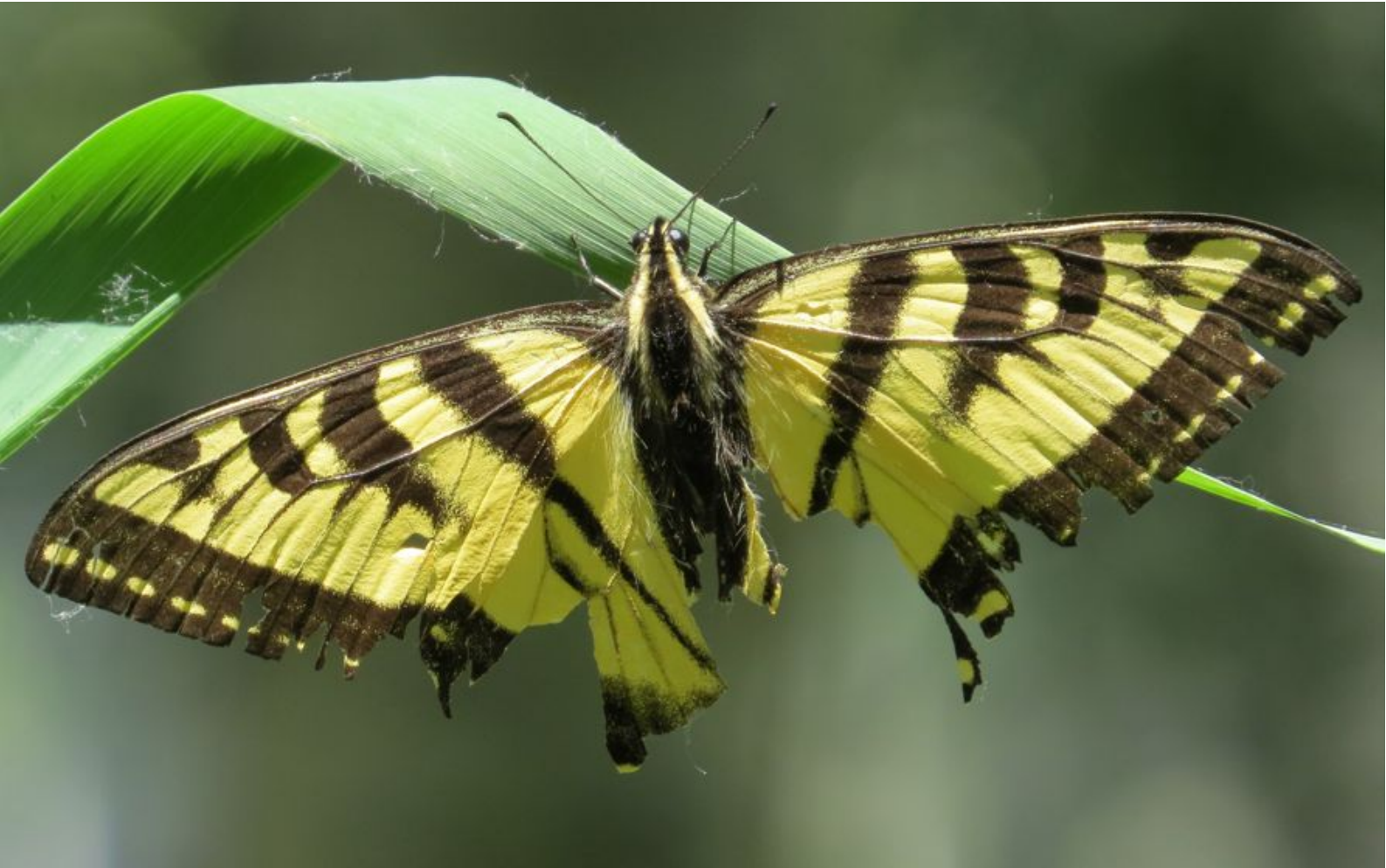
This Western Tiger Swallowtail ( Papilio rutulus ) lost most of its tail to nibbling birds.