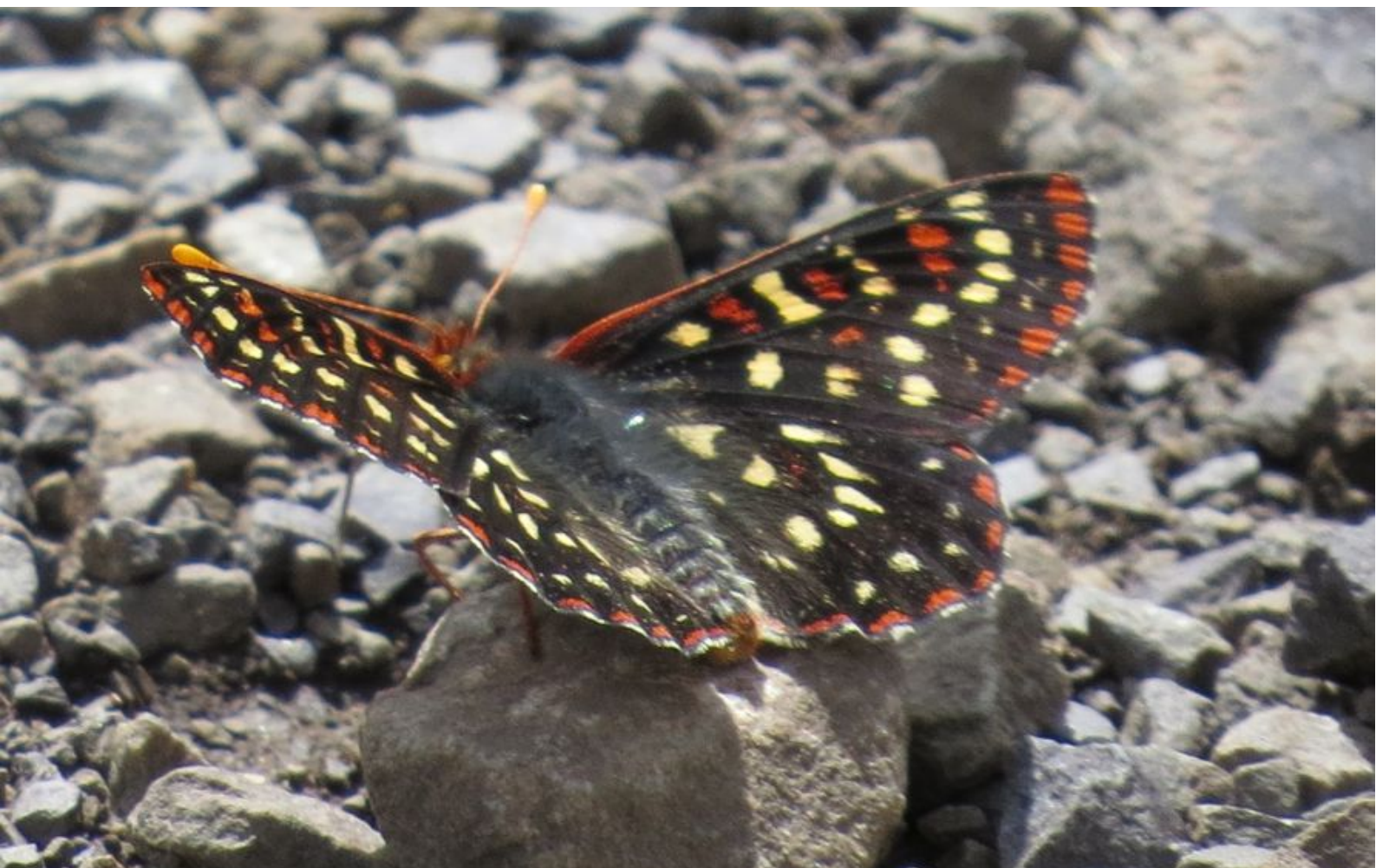
Variable Checkerspots ( Euphydryas chalcedona ) exhibit great variation in spot patterns.