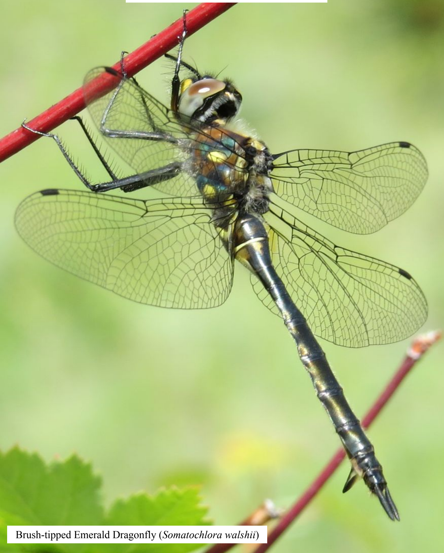
Brush-tipped Emerald Dragonfly ( Somatochlora walshii )