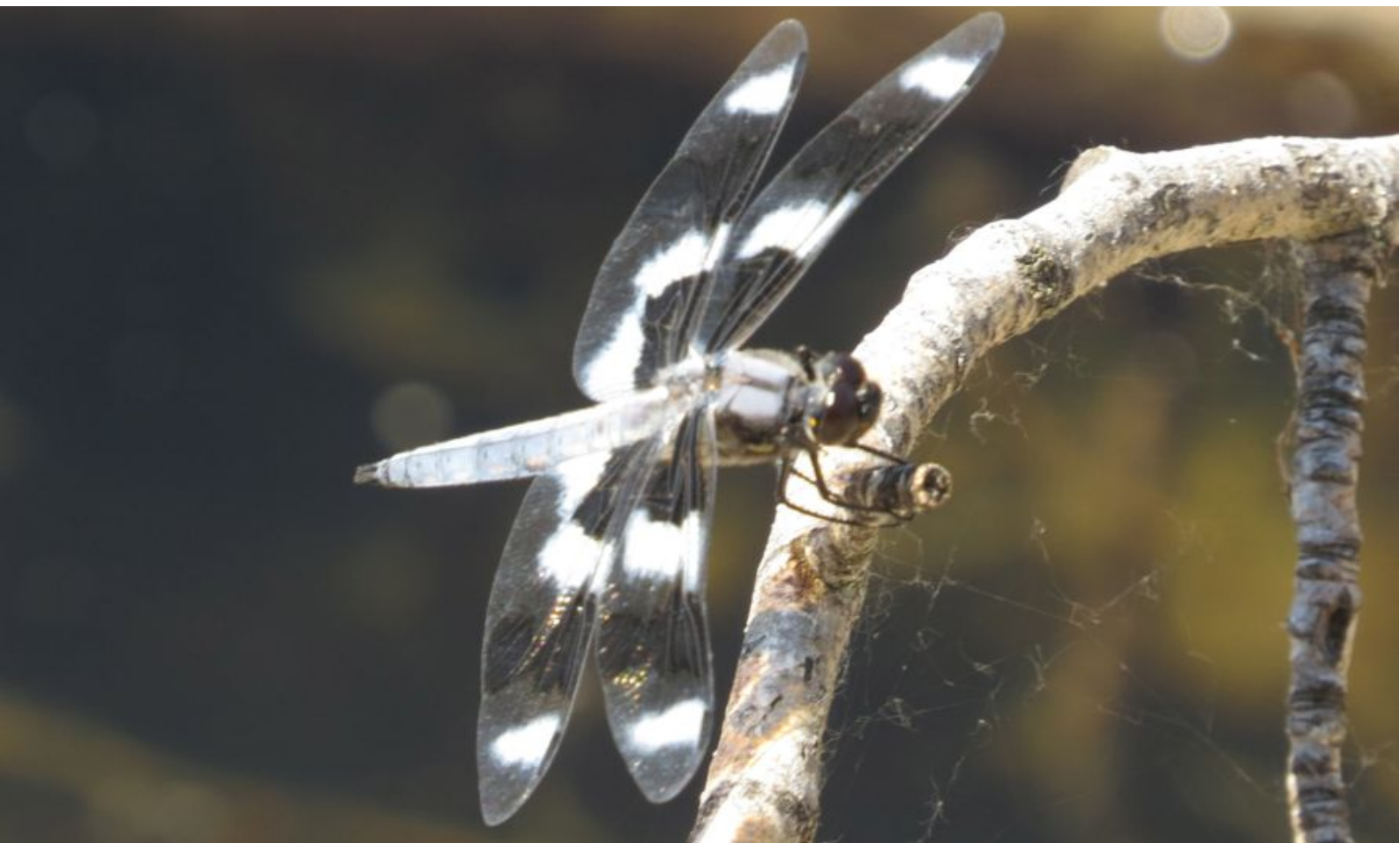
Eight-spotted Skimmers ( Libellula forensis ) are common near the Bitterroot River.