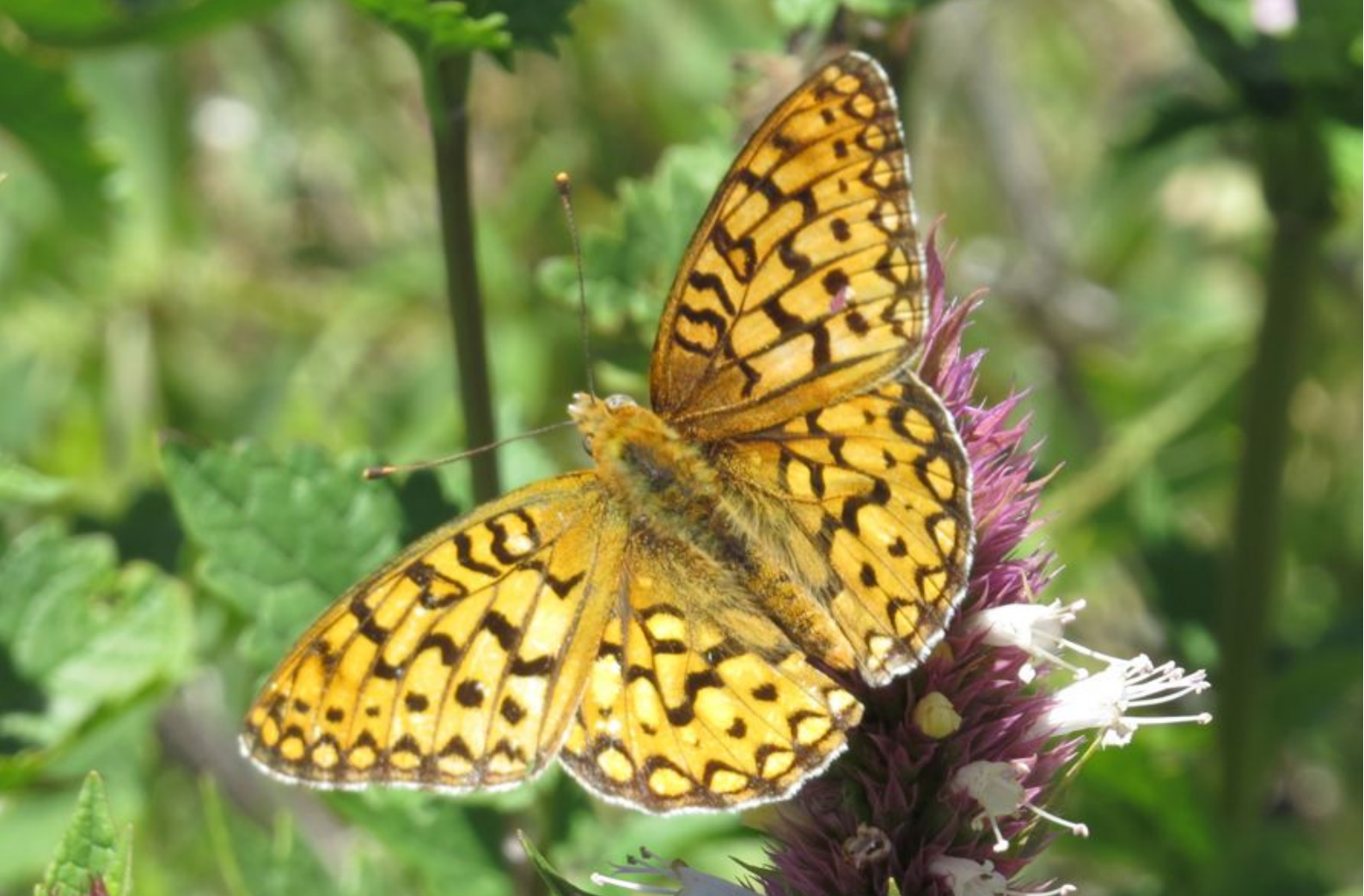
This Silver-bordered Fritillary ( Boloria selene ) pollinates horsemint.