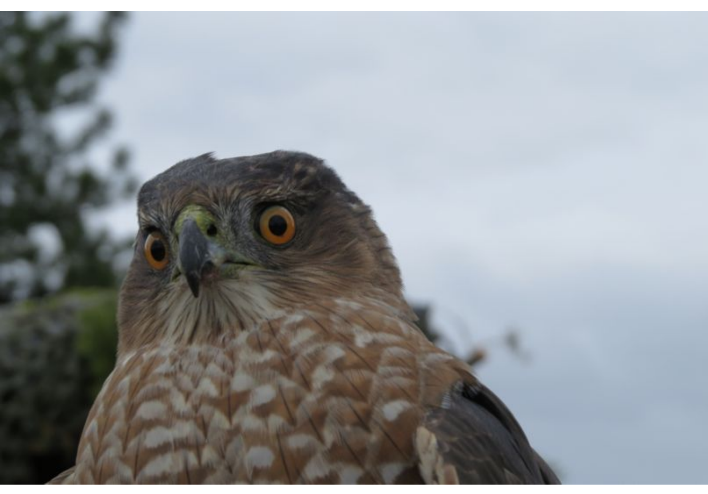
This adult Cooper's hawk was the twelfth caught this year. In 2012, just five Cooper's hawks were captured.