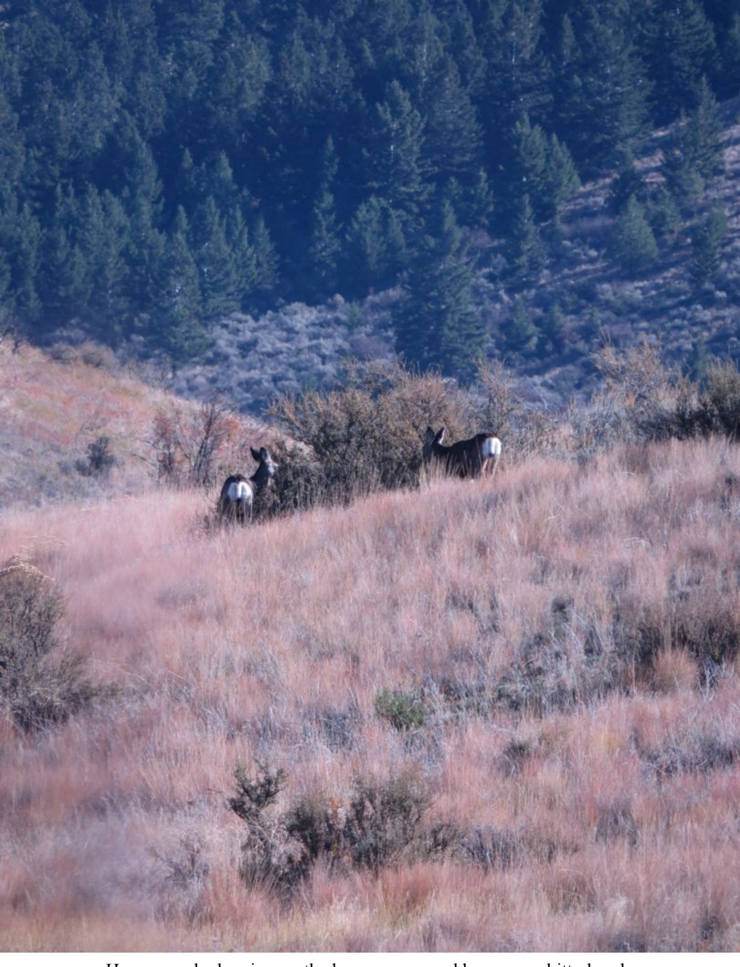
Hungry mule deer ignore the brown grass and browse on bitterbrush.