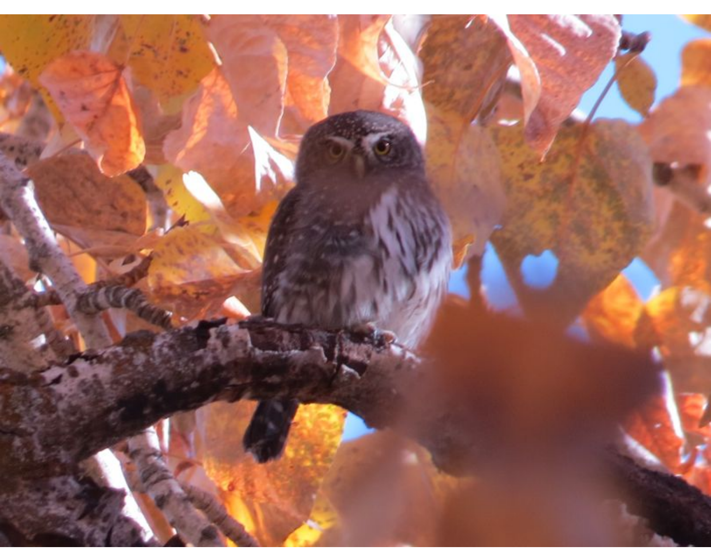
A northern pygmy-owl elicits non-stop alarm calls from nearby nuthatches and chickadees. The owl eventually flushes and silence returns.