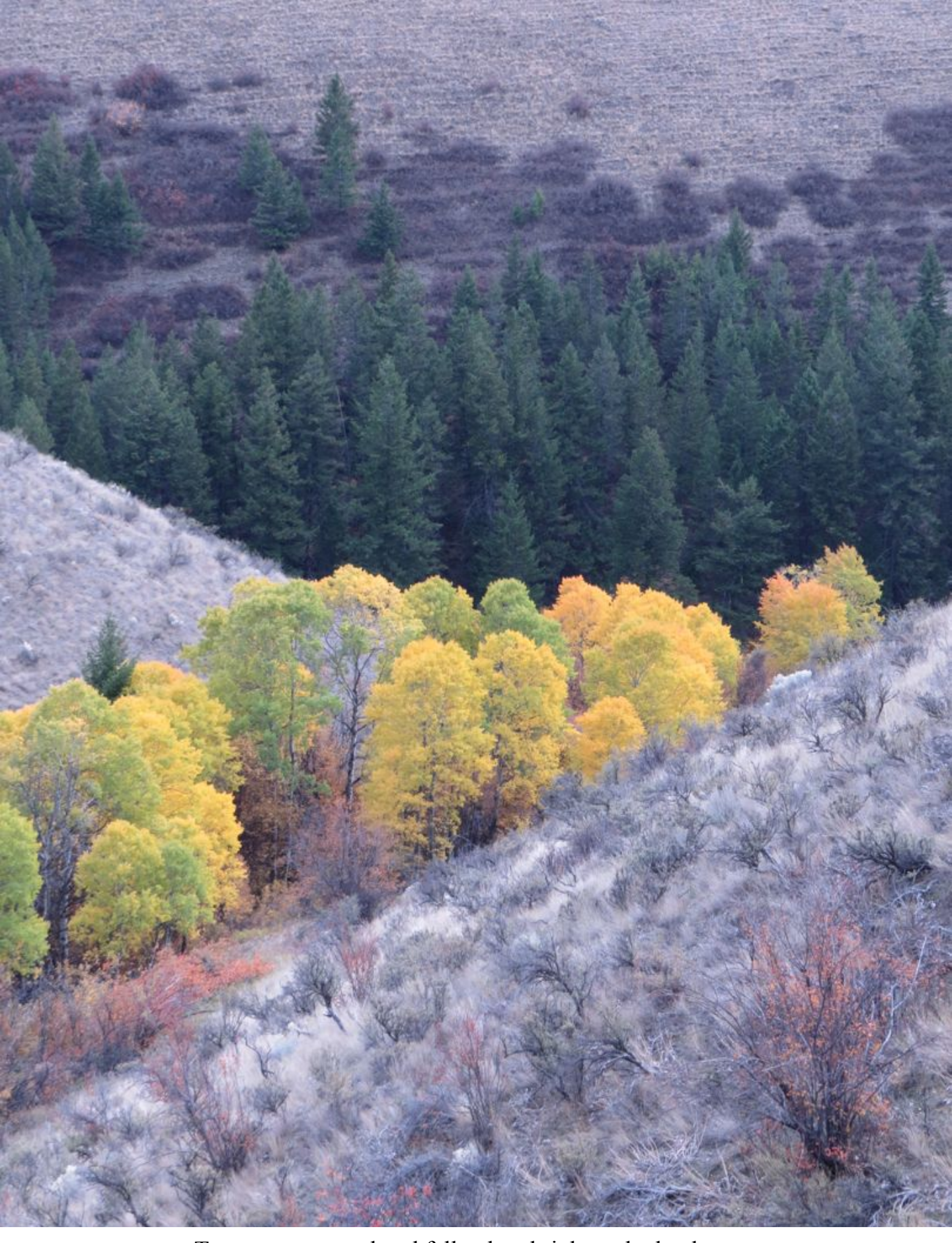
Temperatures cool and fall colors brighten the landscape.