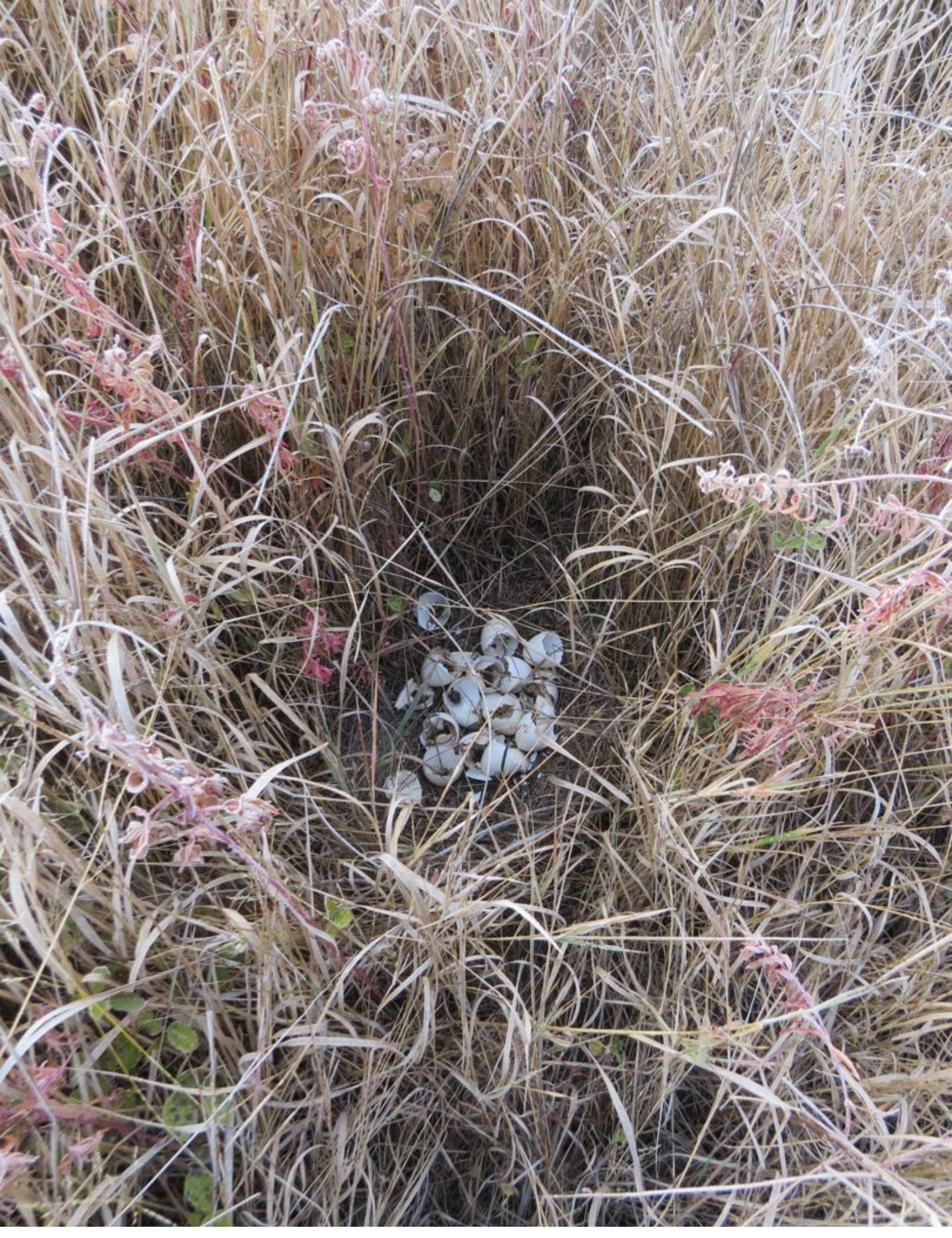
Tall, thick grasses obscure an old turkey's nest.