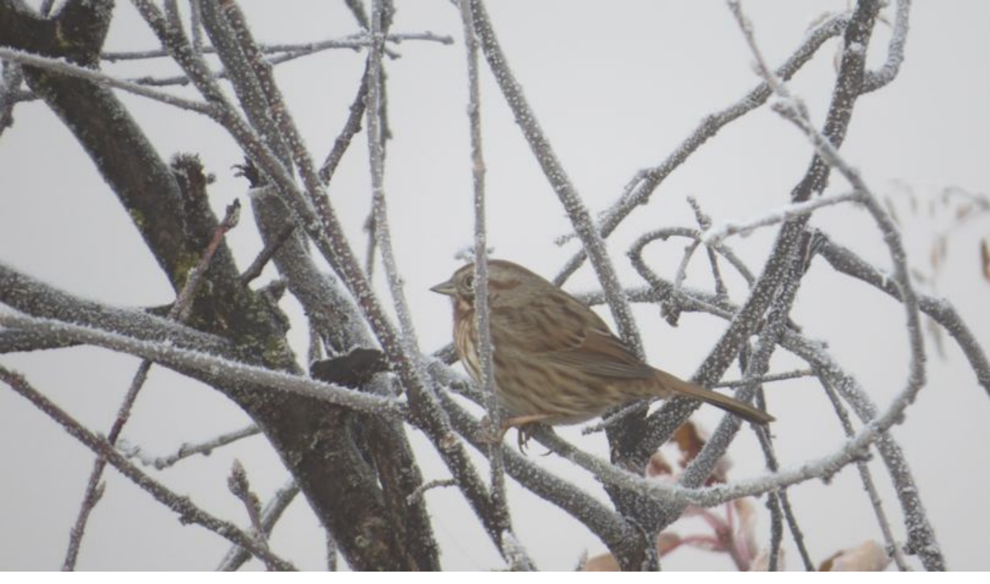
A song sparrow, surrounded by fog, perches on frosted branches. After the fog lifts, icy spider webs glisten in the sun.