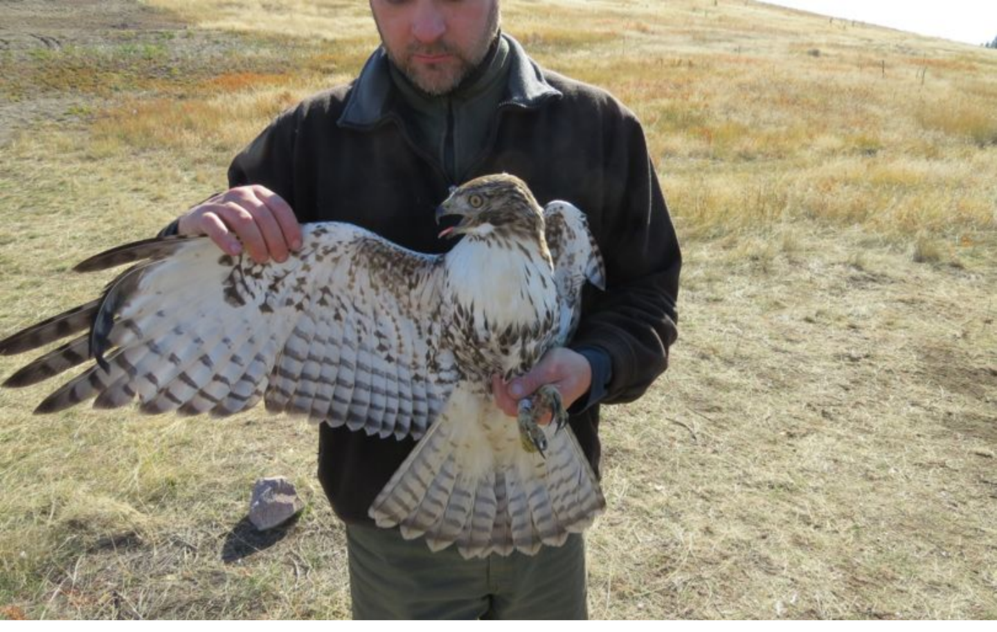
This young Red-tailed Hawk was captured at the lower blind. The curled primary feather on its right wing is unusual; the cause of this abnormality is unknown.